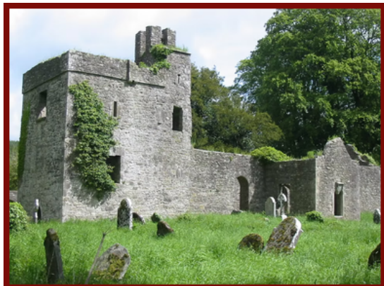
Loughcrew Church and Towerhouse

St. Oliver was born in Loughcrew, Oldcastle, Co. Meath on All Saints Day, 1st November 1625. He studied for the priesthood in Rome and returned to Ireland as the Archbishop of Armagh in 1670 after a 23 year exile. He immediately set to work and there was much work to be done as the Church in Ireland had been without proper leadership for almost thirty years.