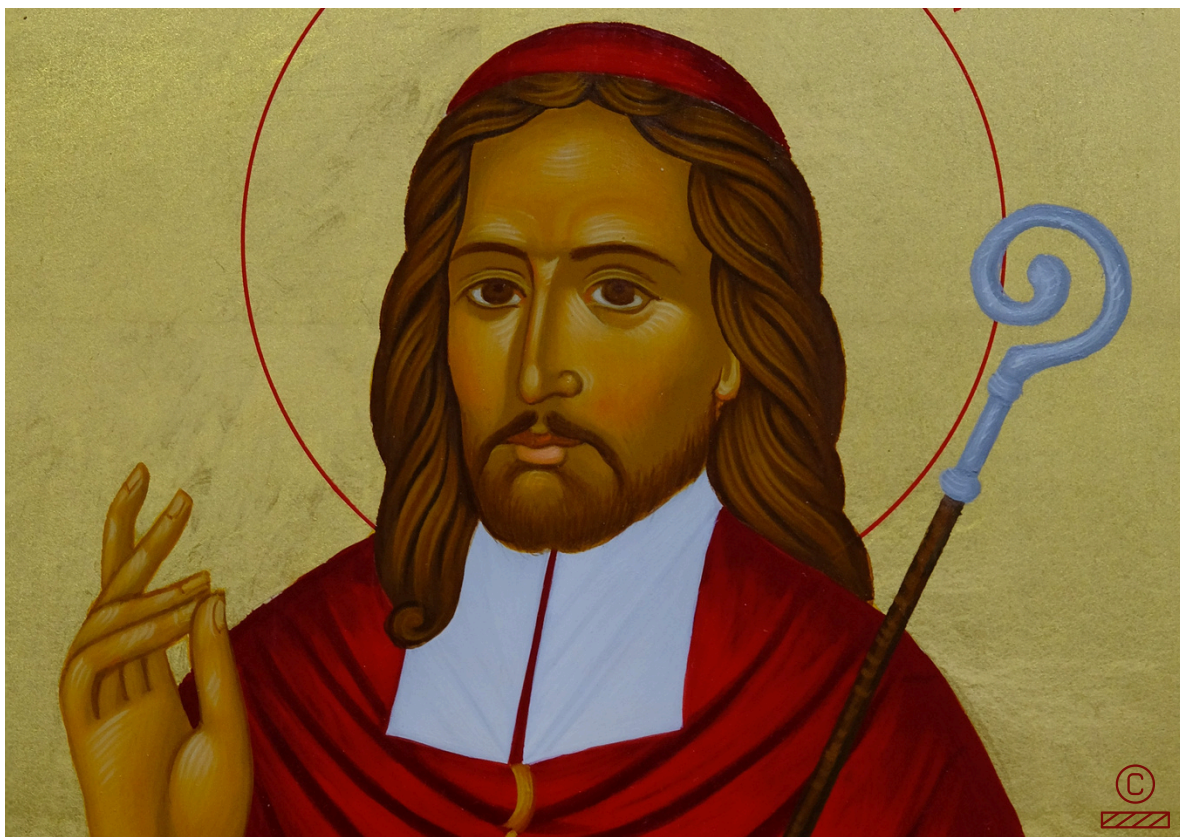
Icon of Oliver Plunkett used with kind permission of the Dominican Community at the Monastery of St. Catherine of Siena, Drogheda. (Image also used on booklet.) cover.